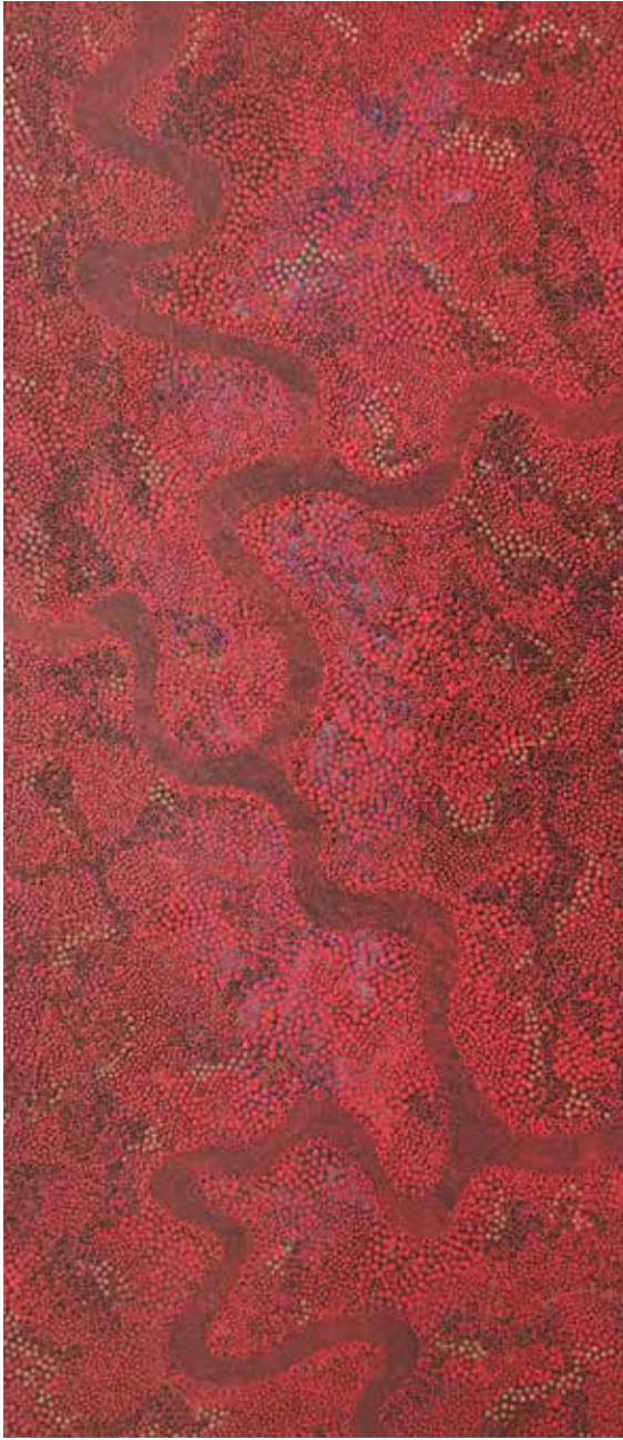
JOSEPHINE LENNON Sturt's Desert Pea 2017 Acrylic on Canvas © Courtesy of the artist