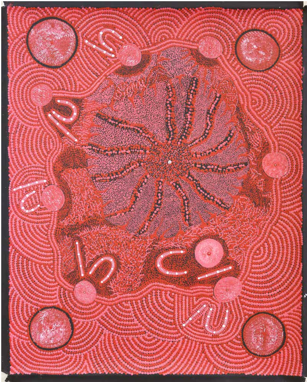
MARION BAKER Seven Sisters 2017, Coober Pedy © Courtesy of the artist