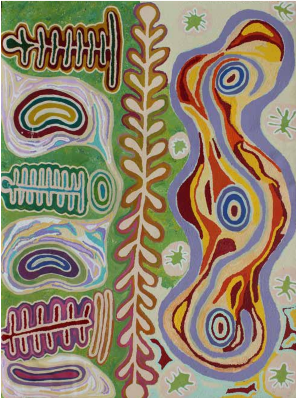
ANYUPA NELSON Yumal 2017 © Ninuku Arts