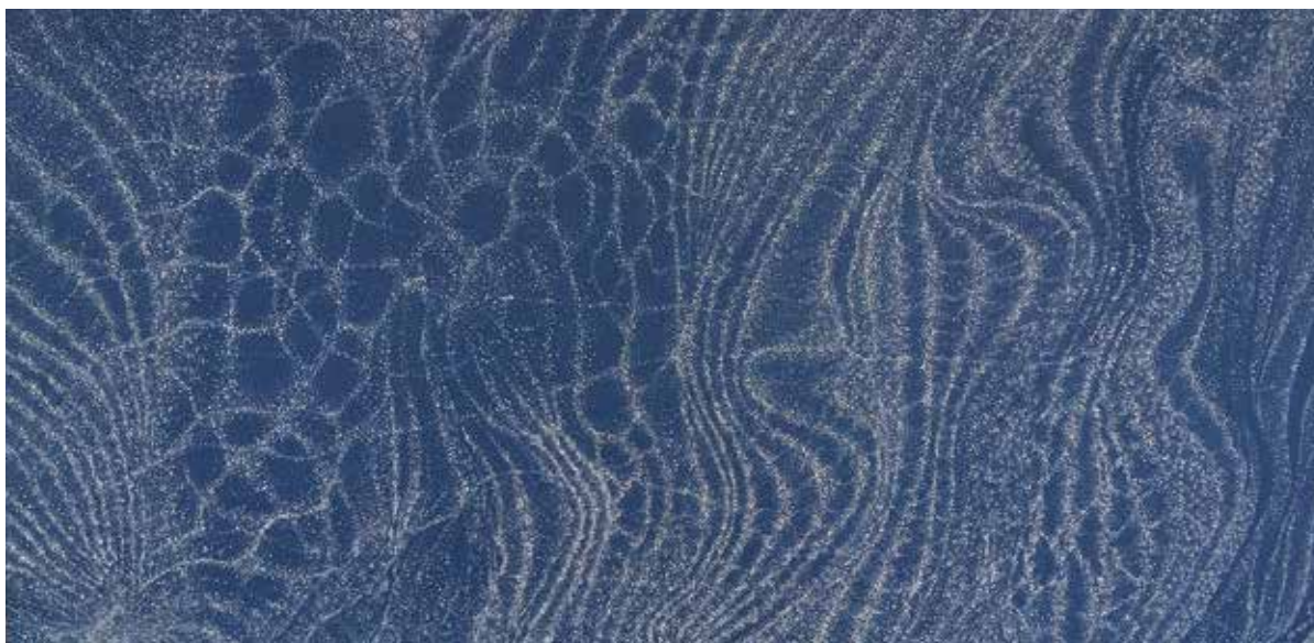
JACKIE SAUNDERS Surfboard (front) 2017