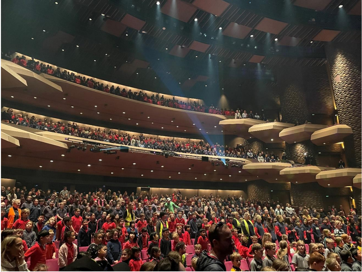
Festival Theatre Auditorium