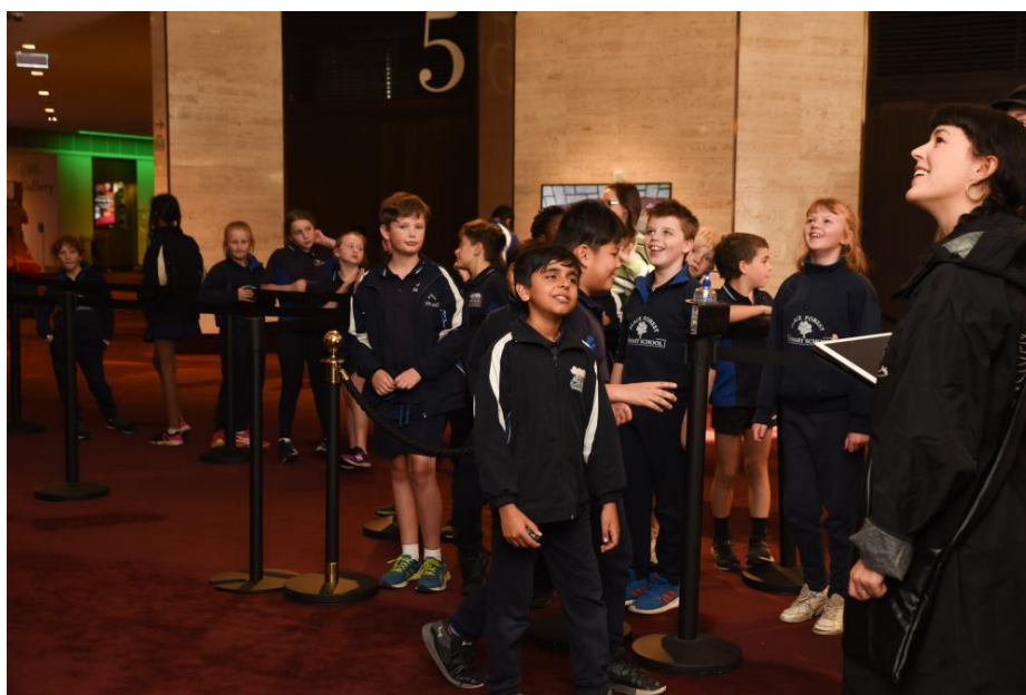
Festival Theatre Foyer