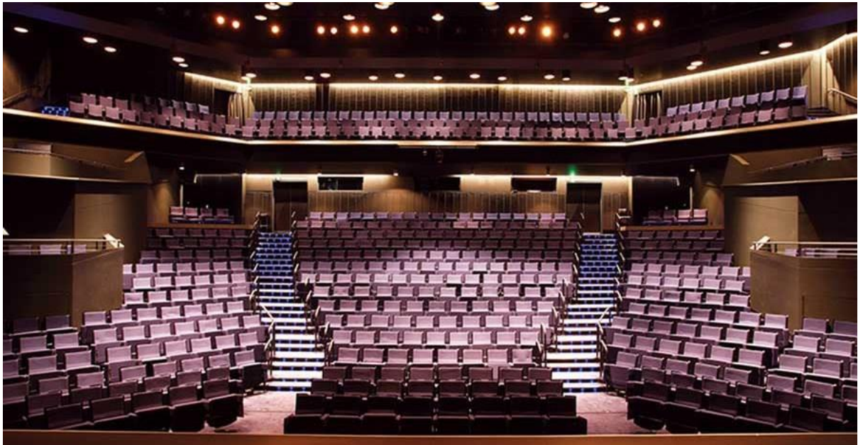
Dunstan Playhouse Auditorium

Each of the DreamBIG shows are in different theatres. The show I am going to see may look a little bit different to these ones. But most of the shows will have a stage, and a seat for me to watch the show.