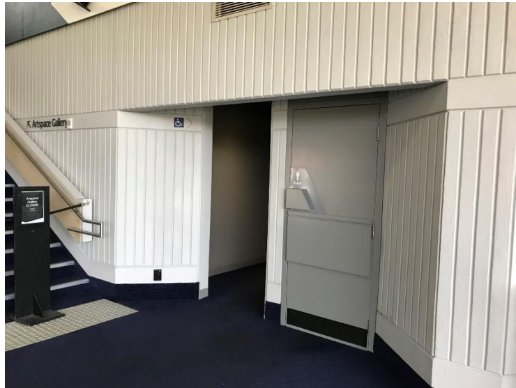
Dunstan Playhouse Toilets - Male

The toilets will have different lighting to the foyer and can be a cramped space.