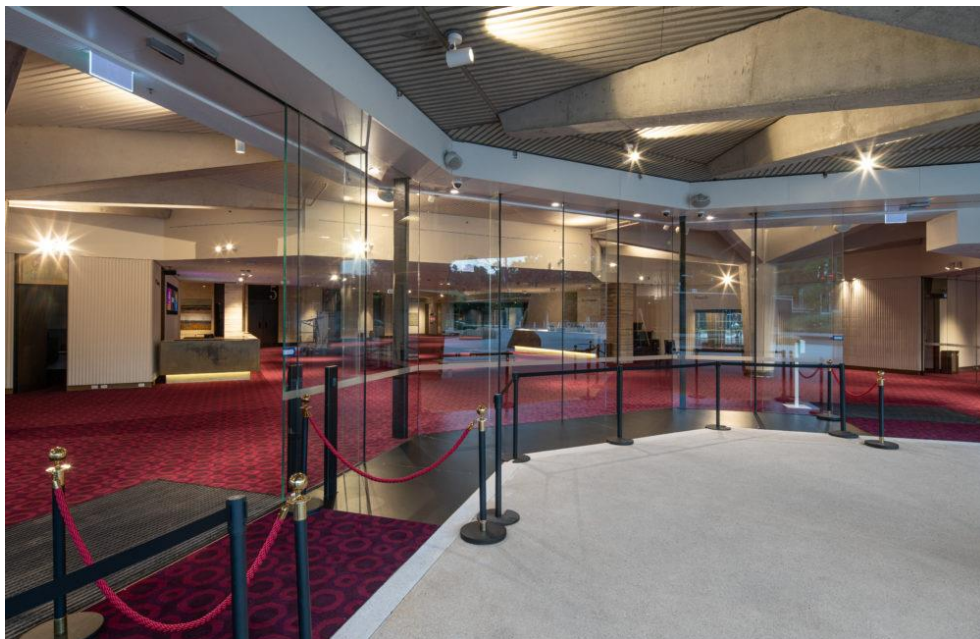
Festival Theatre Entrance