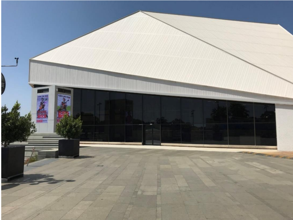
Dunstan Playhouse Entrance

When I arrive, my class will enter through glass doors into a foyer.