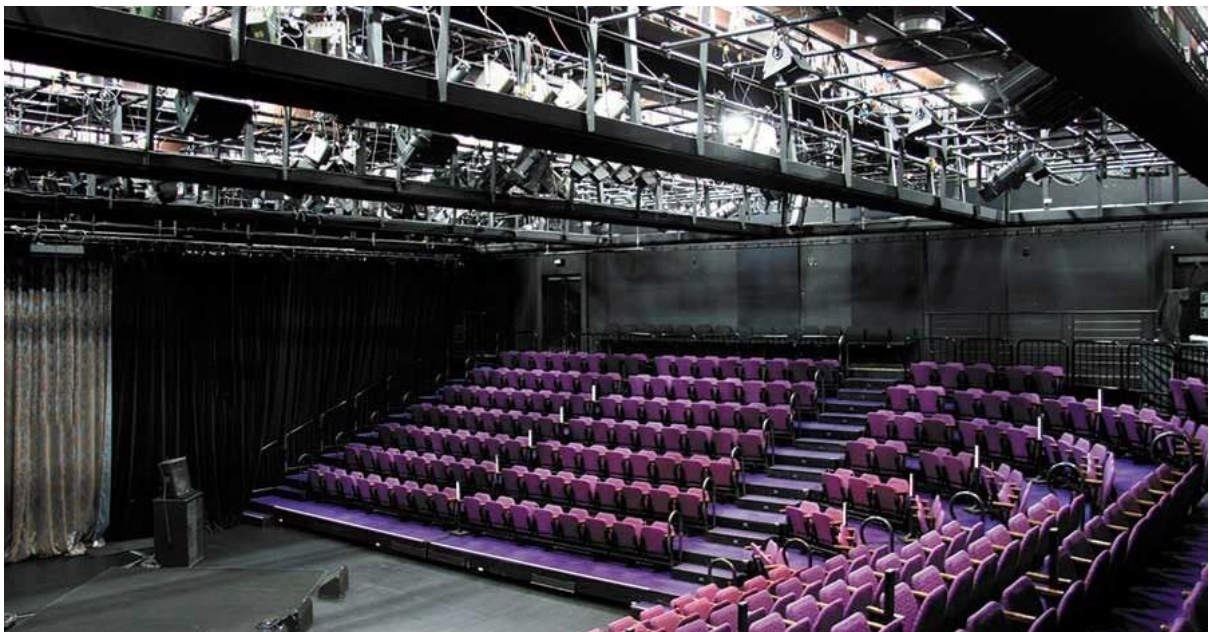
Space Theatre Auditorium