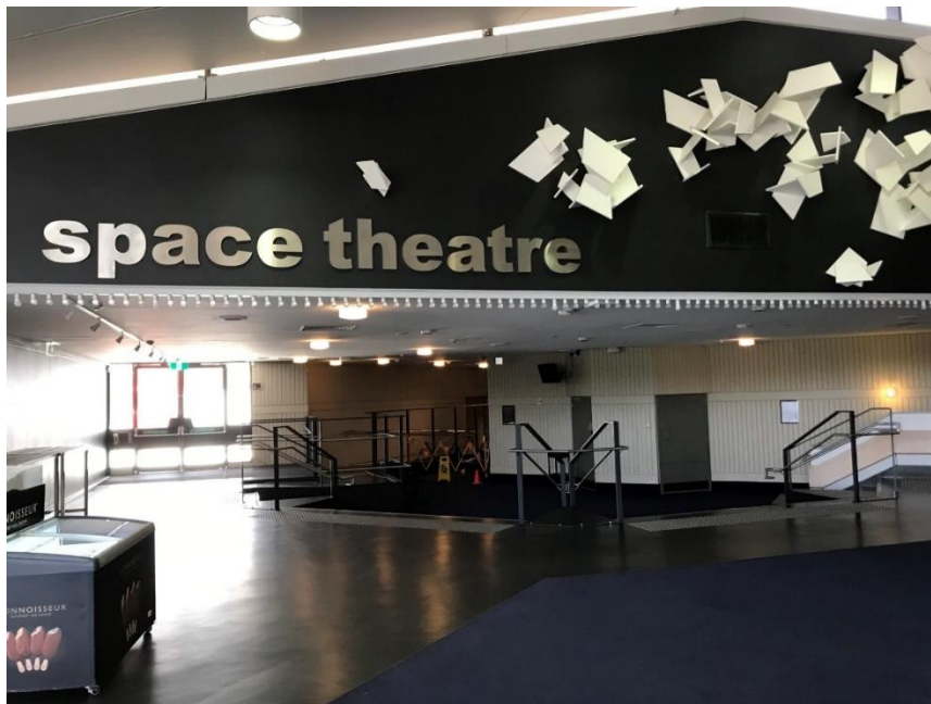
Space Theatre Foyer

There might be other schools and classes I don't know also waiting to go in.