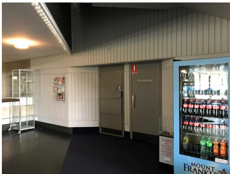
Dunstan Playhouse Toilets – Female

Not all of the DreamBIG shows and activities are at the Adelaide Festival Centre. Some are in different buildings. Some are outside. All of the buildings have toilets and most of them will have a foyer space to wait in before the show or activity starts.