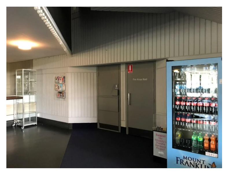
Dunstan Playhouse Toilets – Female

Not all of the DreamBIG shows and activities are at the Adelaide Festival Centre. Some are in different buildings. Some are outside. All of the buildings have toilets and most of them will have a foyer space to wait in before the show or activity starts.