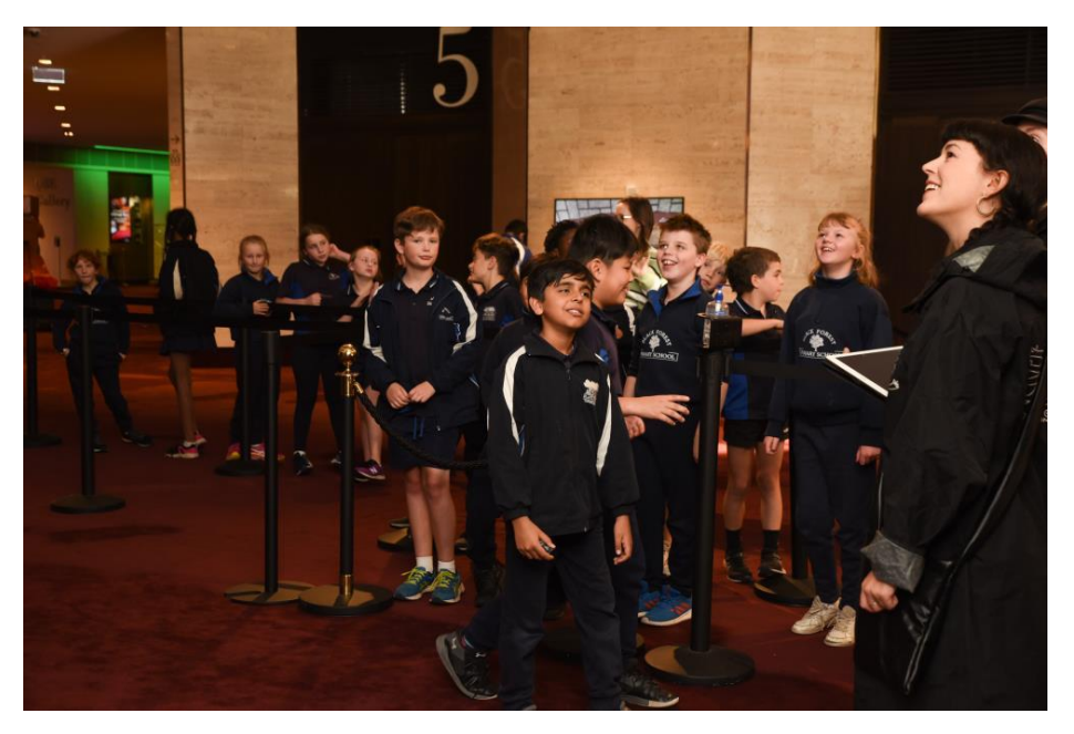
Festival Theatre Foyer