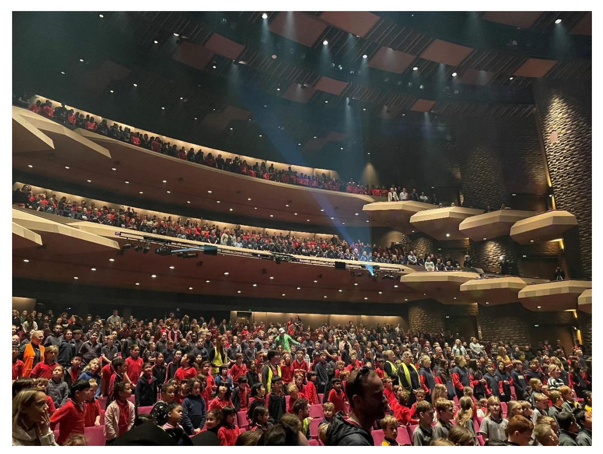
Festival Theatre Auditorium