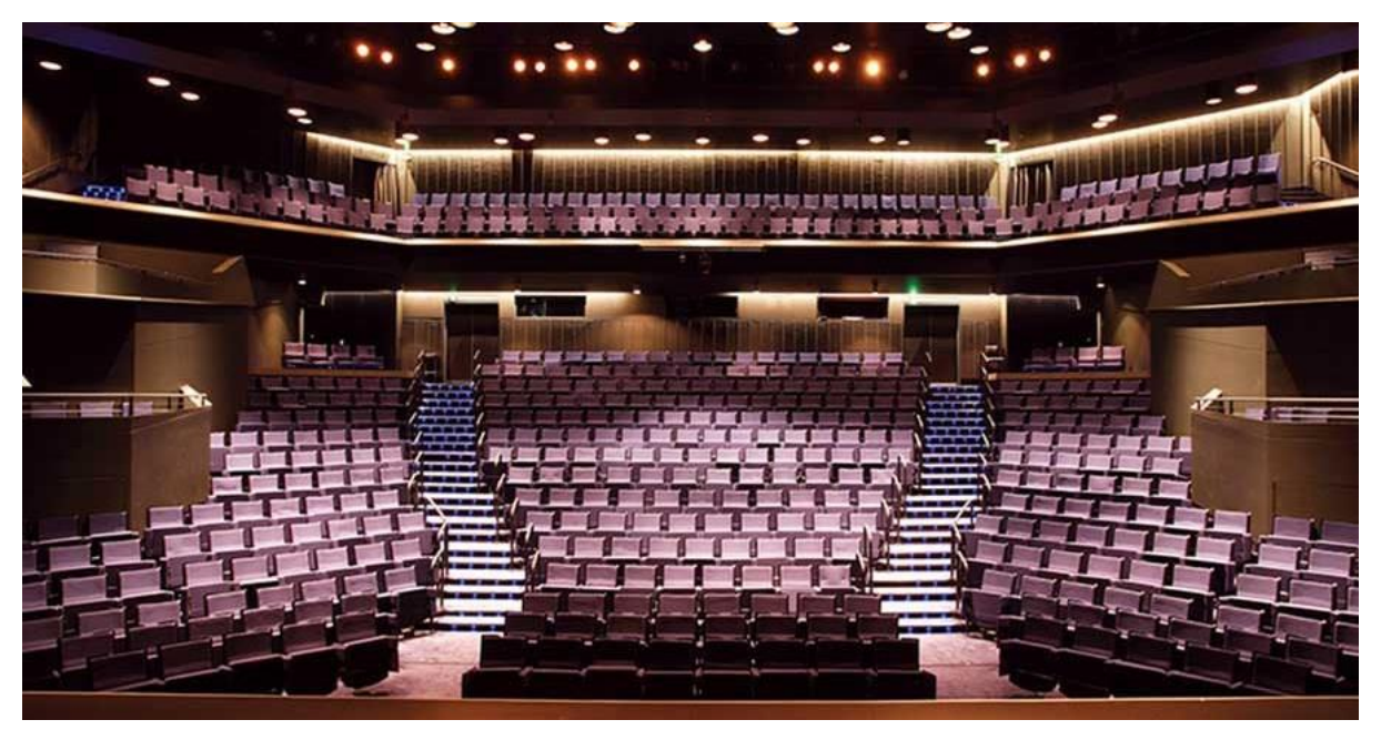
Dunstan Playhouse Auditorium

Each of the DreamBIG shows are in different theatres. The show I am going to see may look a little bit different to these ones. But most of the shows will have a stage, and a seat for me to watch the show.