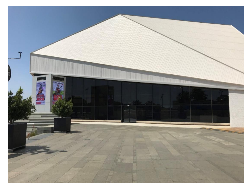
Dunstan Playhouse Entrance

When I arrive, I will enter through glass doors into a foyer.