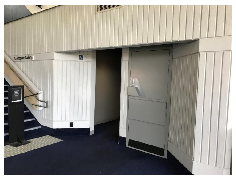
Dunstan Playhouse Toilets - Male

There might be a line to use the toilet and I will have to wait my turn. The toilets will have different lighting to the foyer and can be a tight space.