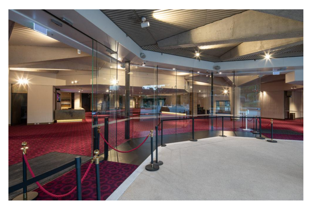
Festival Theatre Entrance