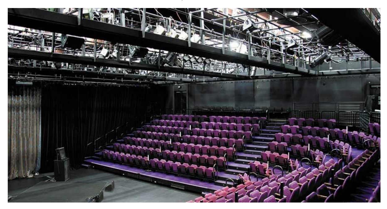
Space Theatre Auditorium