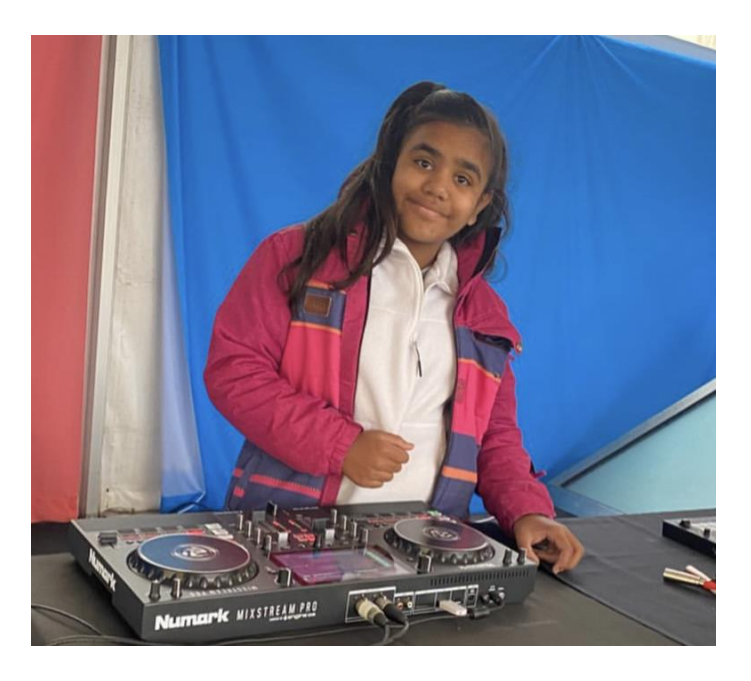
DJ Angel will play music at the event

There might be some videos that play on the screens next to the stage.