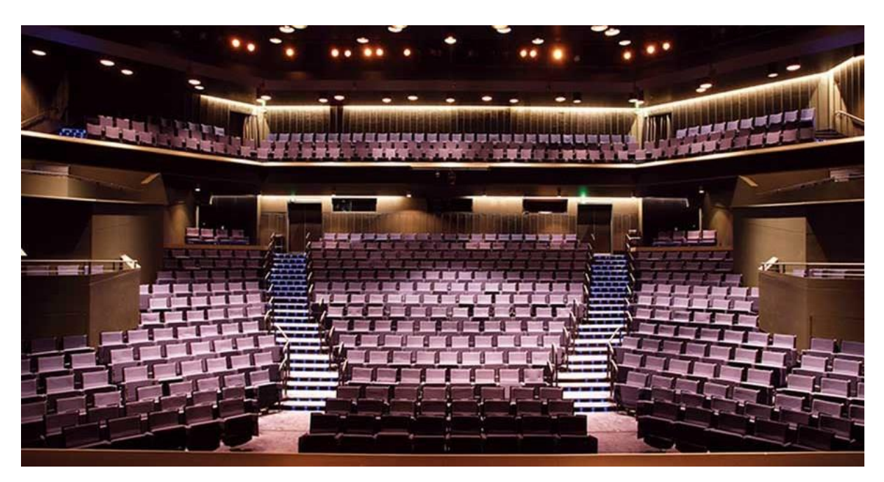
Dunstan Playhouse Auditorium

The show is taking place in the Dunstan Playhouse Theatre at the Adelaide Festival Centre. The Dunstan Playhouse looks like this: